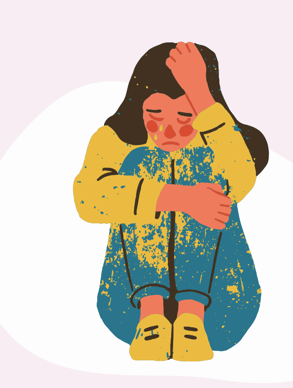
Withdrawn / Anxious