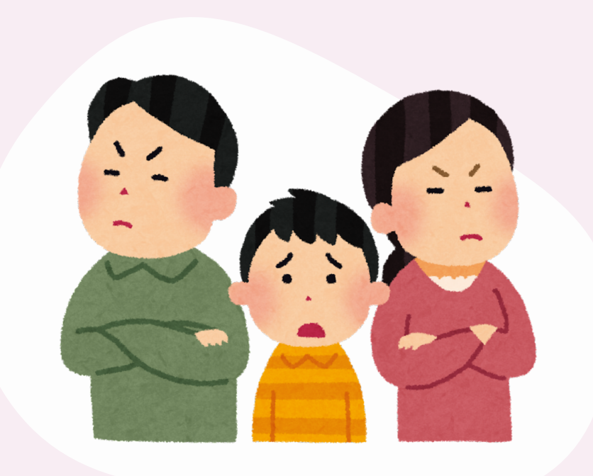
Poor relationship with parent/carer